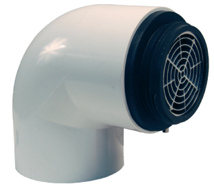
adapters and caps sold separately