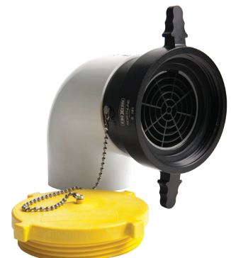
adapters and plugs sold separately