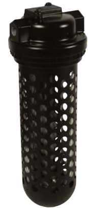
with transparent bowl